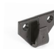
Keku Panel Clip