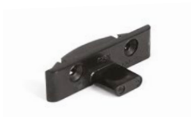
Keku Panel Clip