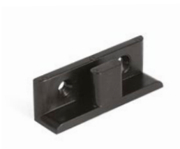
Keku Panel Clip