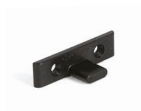
Keku Panel Clip