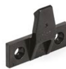
Keku Panel Clip