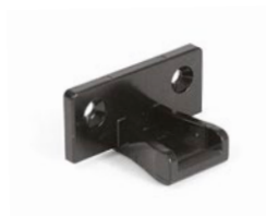
Keku Panel Clip