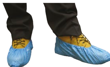
Disposable Over Shoes